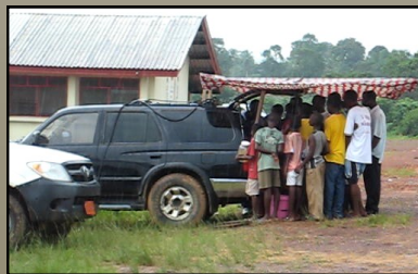
People crowd around MOSES in Bomi County

People from Grand Cape Mount will be able to know the opinions of people in Maryland. Groups that may otherwise never interact will be able to exchange their views, sparking new conversations that will fight ignorance and promote peace.