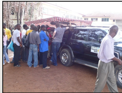
MOSES at the University of Liberia

Educate the public about the TRC — One of the main goals of the MOSES project is to help inform people in the rural areas of Liberia about the mandate and the work of the TRC. To do this, MOSES will contain videos produced by the TRC that explain in Liberian English the finer points of the TRC's mandate and its policy. These videos are designed to educate the public and correct any misconceptions that may exist.