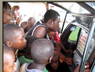
A young man sharing his view on Liberia with the rest of the country

MOSES will also contain videos from TRC programs and events, such as the ongoing public hearings. These videos will allow Liberians to see the work that the TRC is accomplishing now.