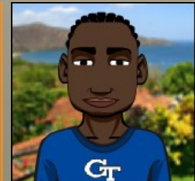
Moses, the cartoon character that guides users as they interact with the MOSES system

The entire MOSES is made to be as rugged and portable as possible. The entire system folds up into a suitcase. The jeep that will transport MOSES has a special battery pack to allow MOSES to run all day without a generator or other power supply. These technologies will allow MOSES to travel across all of Liberia.